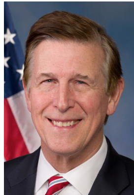
Congressman Don Beyer